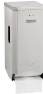
PR2784 CS Satin finish