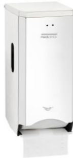
PR2784C Bright finish