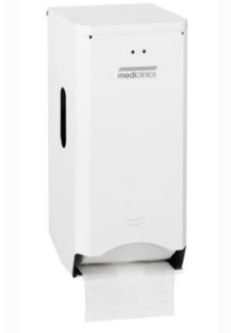
PR2784 White epoxy finish